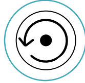
③ 340° rotation