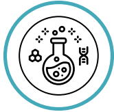
② Fragrance Function